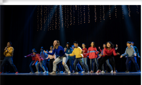
1月1日, 由我校小学生和初中生联合献演 的音乐剧《13岁狂想之旅》登上了梅赛德斯-奔驰文化中心的舞台。