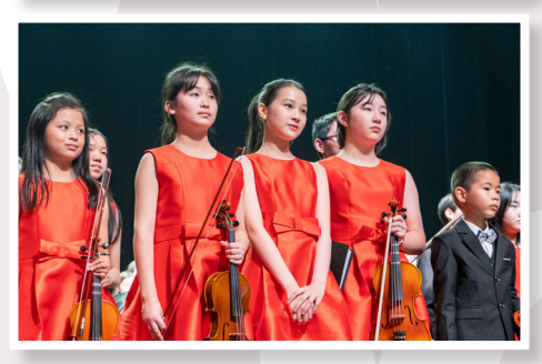
On the 12th of January, some students took part in 2020 New Year's Concert as members of the Shanghai International Youth Orchestra.

1月12日, 我校部分学生作为上海国际青少 年管弦乐团成员参加了在上海东方艺术中心 举行的 2020 新年音乐会。